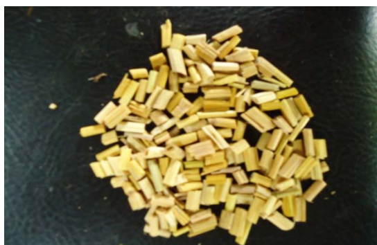
Fig 2: Photographic view of cut straw.

If briquetting technology with rice straw can be established throughout our country, we can overcome our energy crisis largely, reduce our natural gas consumption for household purpose and ultimately our national economy will be strengthened.